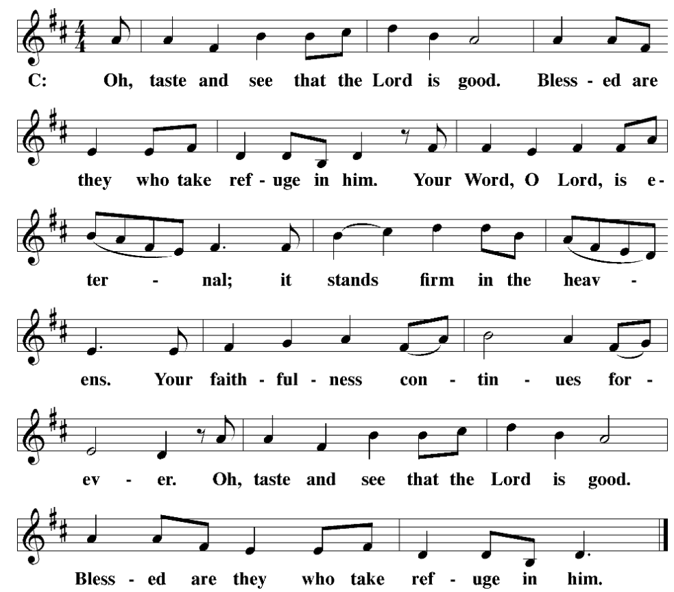
OH, TASTE AND SEE