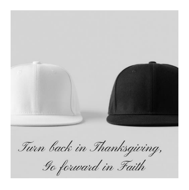
September 10, 2023