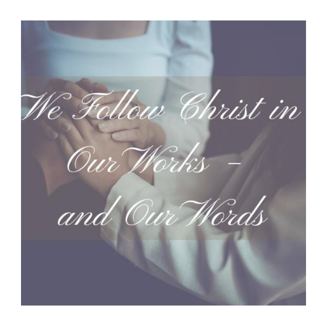
July 9, 2023