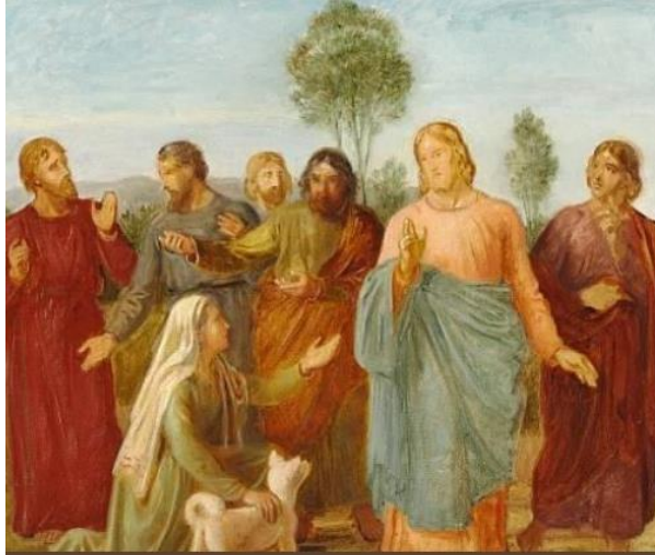
Jesus Feeds Tenacious Faith