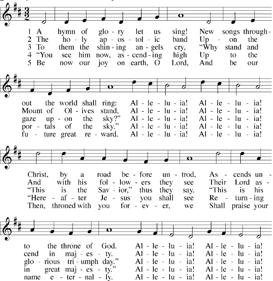
HYMN: 171 "A Hymn of Glory Let Us Sing" (Small Choir Sings Verses 1 & 2; Congregation joins in for Verses 3-6) Please stand for Verse 6

This is an opportunity to quiet your mind and heart and prepare for the joy of worshipping your God.