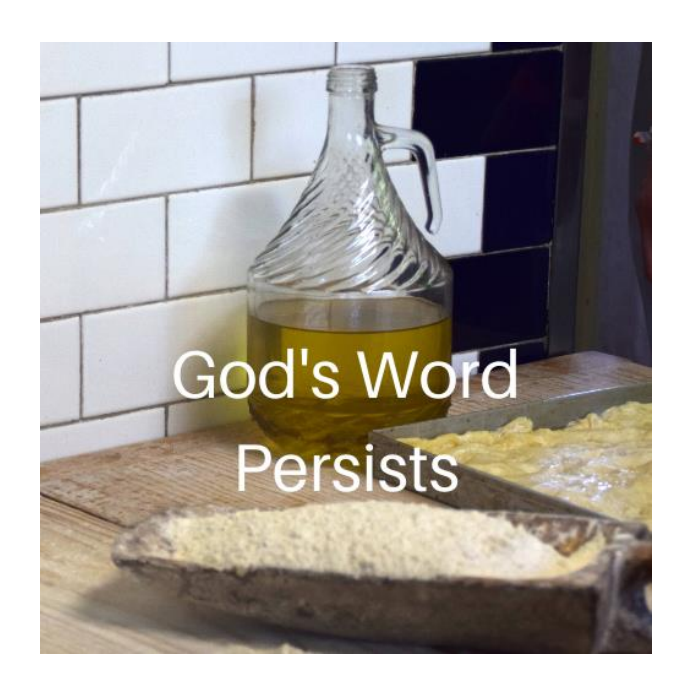
January 30, 2022